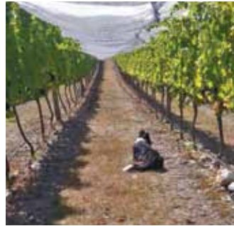
Grapes under cover at 8 Ranges Wines vineyard, which overlooks the Clutha River.